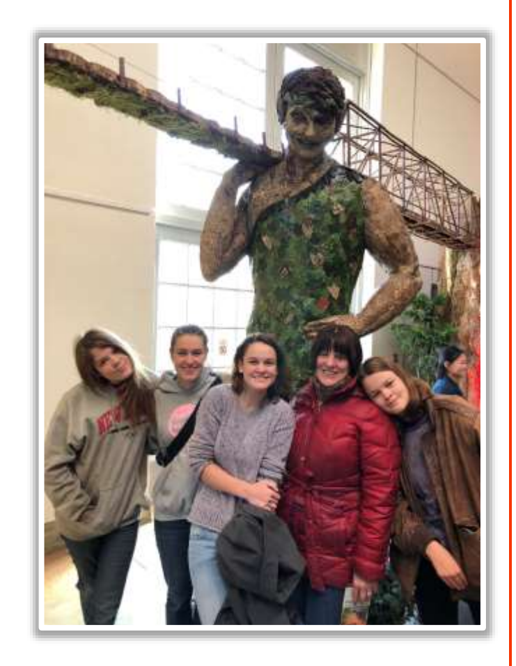
Above and Below: Inside the U.S. Botanical Gardens – 28 December

But my experience has been that most people aren't very good at that. A couple of 35 year olds may have a somewhat clearer view of their future than a couple of 21 year olds do, but certainly not a clear enough one to justify making a lifelong commitment. Marriage at any