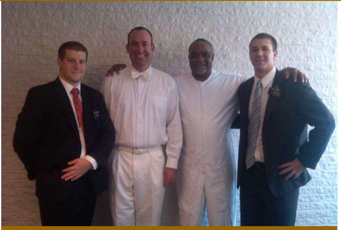
Two elders I could hug (see letter), a really neat guy (see letter), and me (I'm the guy in the bow tie).